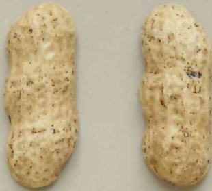
NATURAL SHELL COLOR