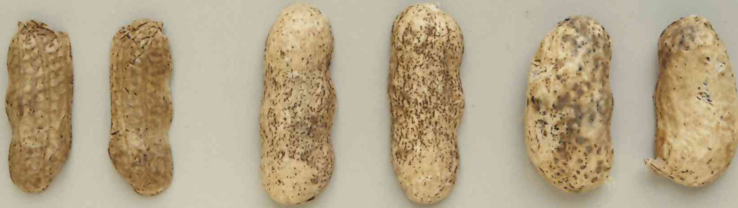
25% OF SURFACE SHOWING DISCOLORATION