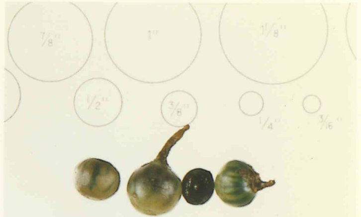
Horse Nettle (Briarball or Treadsatter Ball)