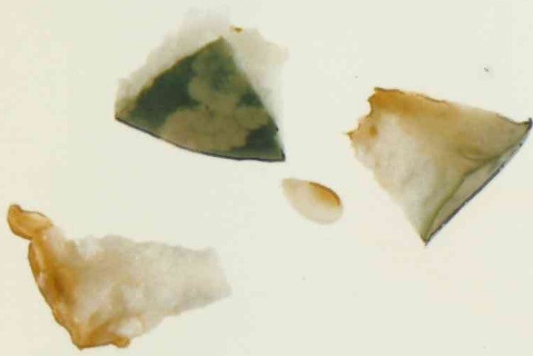
Pieces of Citron