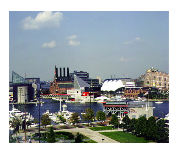
47<sup>th</sup> Annual NMNA Conference November 4-6, 2004

Make your reservations now! 1-800-996-3426