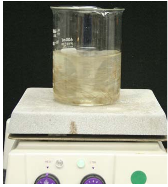
Magnetic stir plate and stir bar removing coating material from a tall fescue sample.

For more information on this article, please contact Botanist Todd Erickson at (704) 810-7266; todd.erickson@ams.usda.gov.