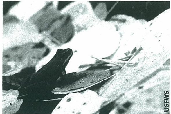
The processed leafy greens industry is concerned with foreign objects (small animals) being chopped up by mechanical harvesters. Small wildlife such as this Pacific tree frog have not been found to be E. coli O157 vectors, yet the processors are mandating farmers destroy habitat in the name of public health, instead of redesigning the equipment.

When the FDA advised consumers against eating any fresh spinach in the fall of 2006, the spinach growers, processors, and shippers lost an estimated $100 million (Nagin, 2007). Immediately, the industry began strategizing on how to get its markets back. Everyone who had anything to do with food safety became involved, from the big supermarket chains to the shippers, processors, and large growing concerns. A major theme was to impose farm requirements that eliminated wildlife habitat regardless of the environmental damage.