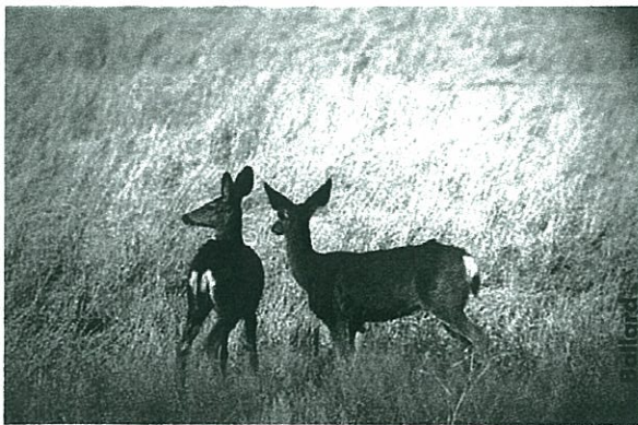
Studies have repeatedly demonstrated that deer present little to no danger as carriers of E. coli O157, yet they are listed as animals of significant risk under California's Leafy Green Marketing Agreement. As a result, habitat that would otherwise provide for food safety is destroyed.

Distribution of E. coli O157 comes from cattle on rangeland, the use of manure on crops, dust, water, other farm animals and—to a much lesser extent—wildlife. Wild animals have been found to carry pathogenic E. coli , but research shows them having little to no role as vectors. Individuals can be carriers, such as a few feral pigs or a raccoon or chipmunk (Maldonado et al., 2005), but formal