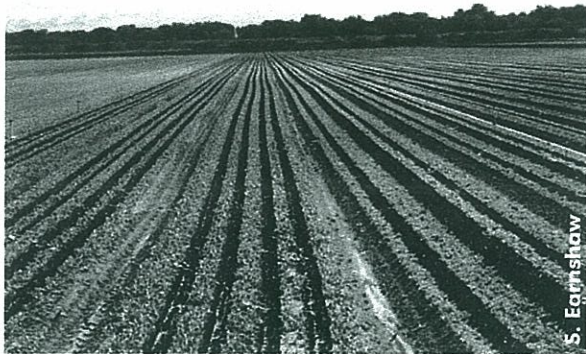
Regulations for leafy greens destined for processing should not apply to whole heads or bunched greens; instead separate metrics are needed.

or without oxygen. When bagged leafy greens are not kept continuously cold en route to the farmers' market, a big box store across the country, or a consumer's home after purchase, chances of E. coli O157 proliferation greatly increase. Having so much cut surface area in fresh-cut bagged greens increases the exposure route of the pathogen. For industrially produced fresh-cut leafy greens, the contamination risks expand further. Harvests from several large fields are mixed together in wash water, amplifying chances of sickening more people. In recent years, processors have also extended the shelf life, possibly pushing the product near its unsafe range, without the knowledge of the consumer. One-third of the illnesses were associated with "sell by dates" that were at their limit (Richardson, 2008). The fresh-cut industry should reduce the shelf life to what it was just a few years ago—from 15 to 17 days to 12 days.