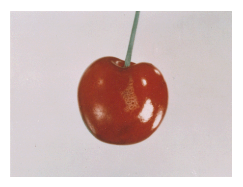
Not Damaged (Lower Limit)