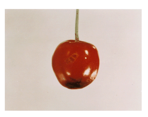
Not Damaged (Lower Limit)

CHR-CP-3 Defects April 1990 (Previously May 1978, Side I)