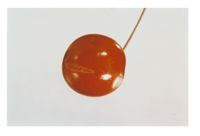
Crack Not Well Healed