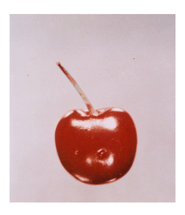
Not Damaged Max Allowed