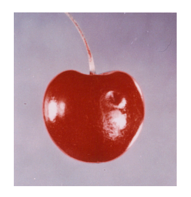
Not Damaged Max Allowed