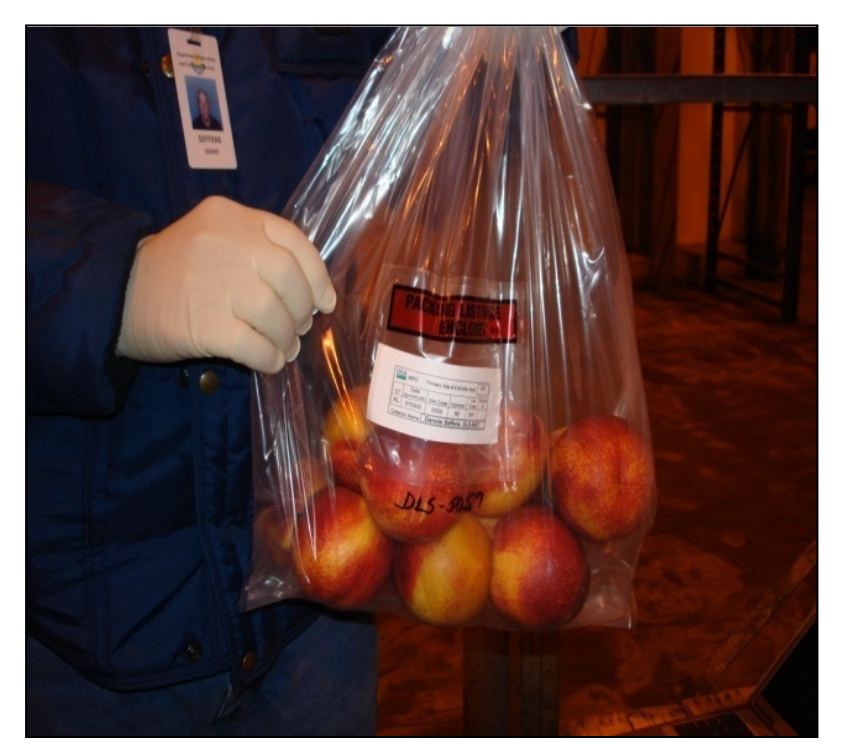
Plastic bags should be used for samples