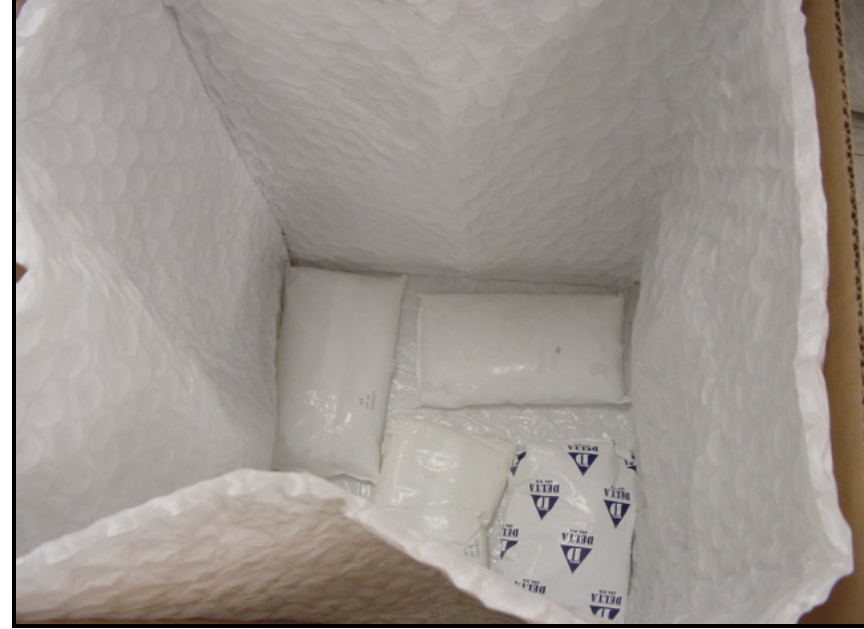
Several ice packs placed inside box to pre-cool container